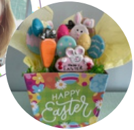
Donna Armstrong The Flour Garden