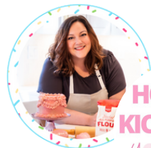
HOW TO KICKSTART Your Home Bakery Business