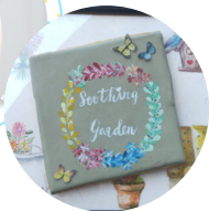
Sandy Huang Soothing and Sweet