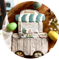
Fabiola Romano The Fabulous Cookies

Textures & Treats For the Easter Bunny -