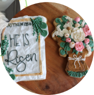
Crystal Perez Edible Art Studios