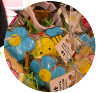
Diane Mercado Pink Cupcake Shack