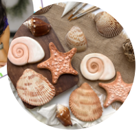
Wendy Alba Wendy's Cookie Studio