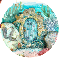
Rebecca Norton 2B's Cookies